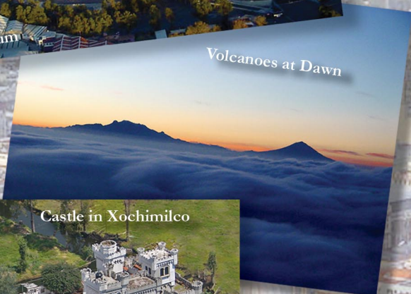
Volcanoes at Dawn