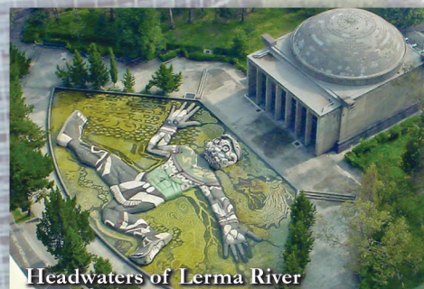
Headwaters of Lerma River