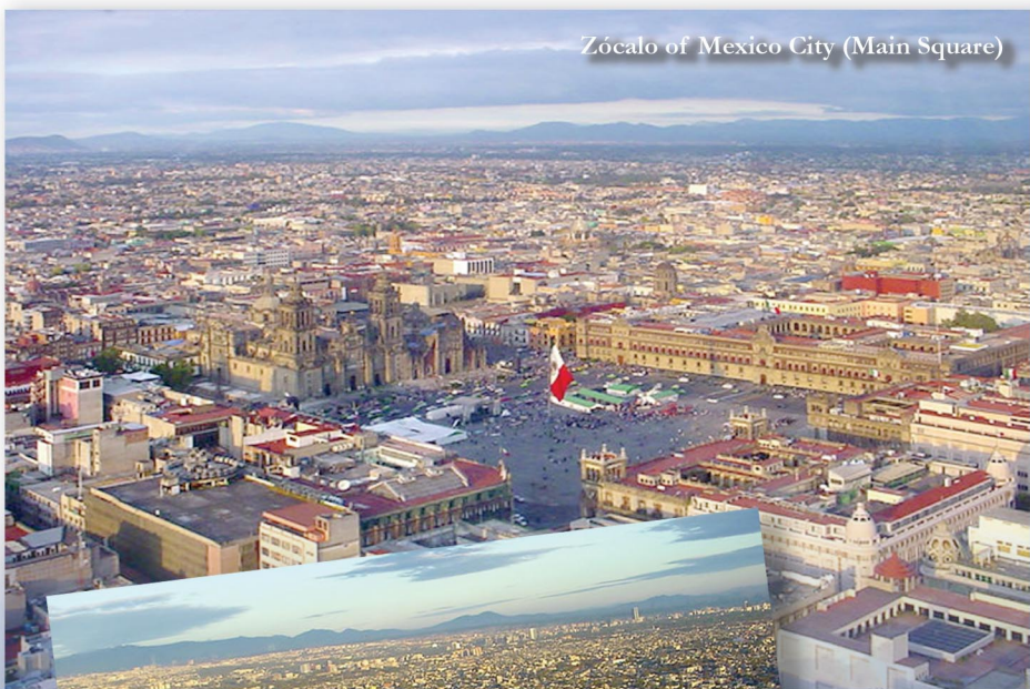
Zócalo of Mexico City (Main Square)