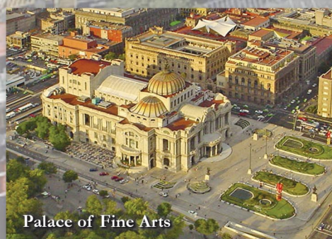
Palace of Fine Arts