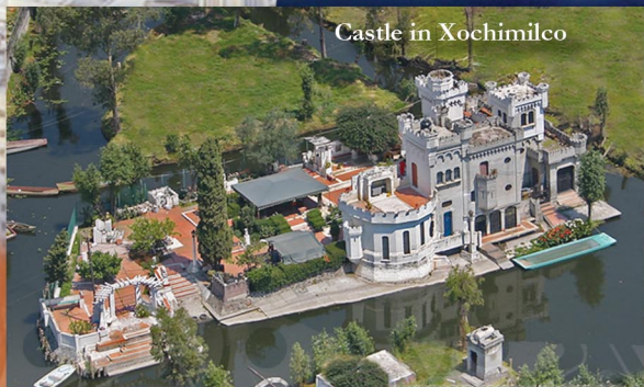
Castle in Xochimilco