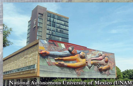
National Autonomous University of Mexico (UNAM)